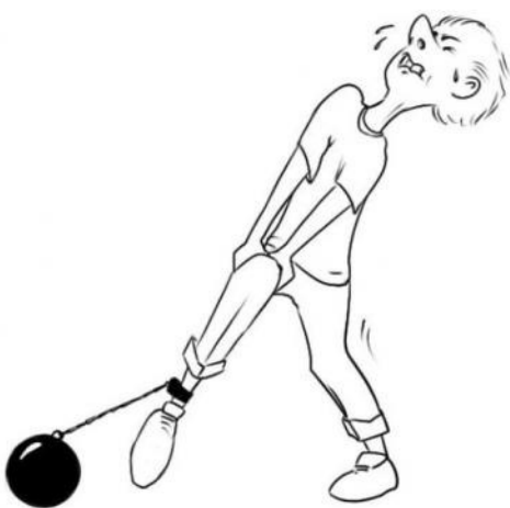
“b_____ and c_____”