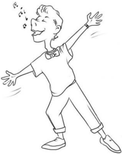
“make a s_____ and d_____” (about sth)