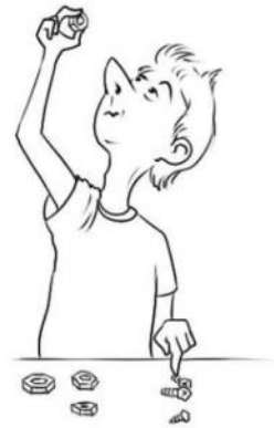
“n_____ and b_____”