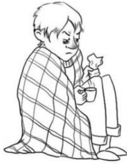
“s_____ and t_____”