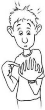
“all f_____ and t_____”