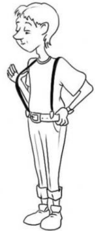
“b_____ and b_____”