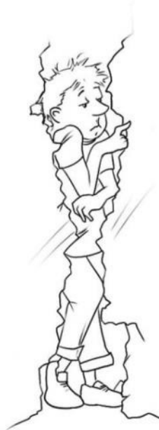
“between a r_____ and a h_____ p_____”