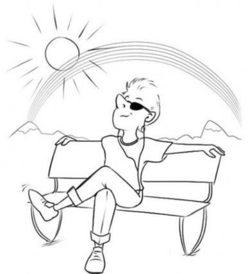
“all s_____ and r_____”

(all fingers and thumbs; sick and tired; nuts and bolts; make a song and dance; touch and go; belt and braces; ball and chain; between a rock and a hard place; all sunshine and rainbows)